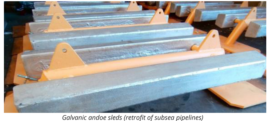
Segment of clamp with galvanic anodes (monopiles, single point moorings, etc)